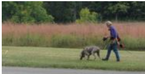
Approaching the start flag, AKC National Tracking Invitational, 2009